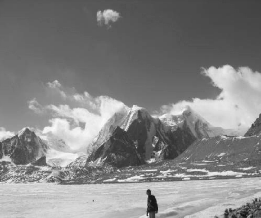
(Gurudongmar lake in Sikkim .)

http://orion.lib.virginia.edu/thdl/texts/reprints/nepali_times/Nepali_Times_035.pdf